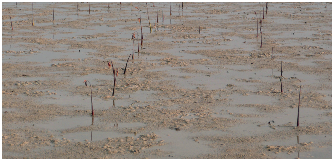
Failed replantation of mangrove species in Saloum delta, Senegal

In Senegal, between 2009 and 2011, the participatory mangrove restoration project “Plant Your Tree”, which aimed at generating carbon credits, failed to properly consider local knowledge and experience or to involve local people in decision-making. Although many villagers were paid to transplant mangrove propagules, they did not participate in the selection of reforestation sites, species or transplanting techniques or period, which are key for the success of replantation. Eventually, they lost their access and use rights over the reforested areas and the replantation failed. Drawing lessons from existing projects and the recommendations of a platform of experts, the French Facility for Global Environment (FFEM) is now promoting in-depth socio-ecological diagnoses in the projects it supports, particularly in Senegal, prior to their implementation.